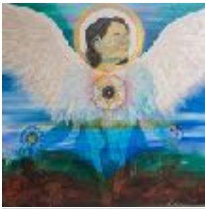
Little Buddha Heather