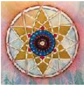
Council of Twenty-Four 2 sets of 12 pointed stars in the dreamcatcher